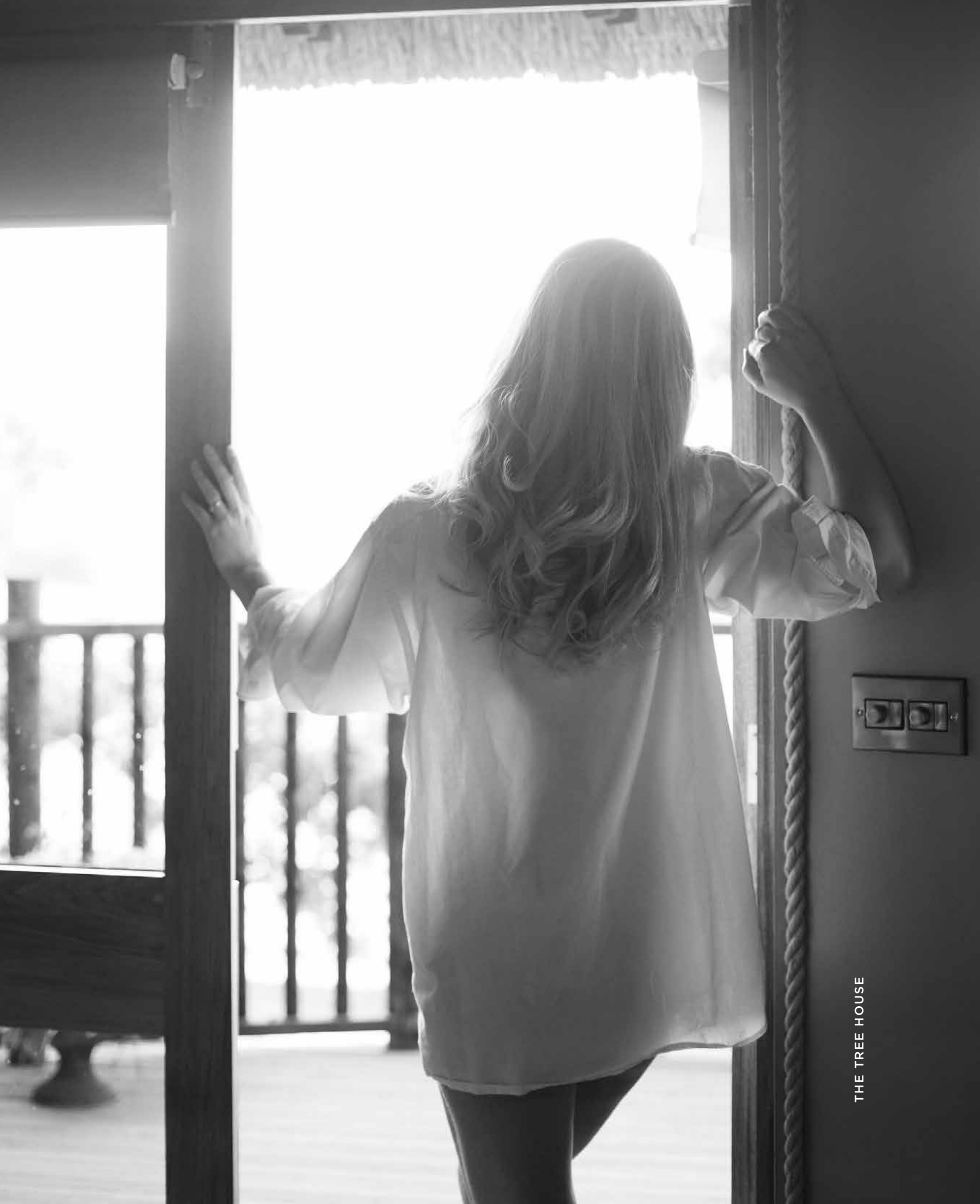
THE TREE HOUSE